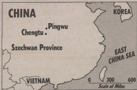
MAP shows area in China where aliens swooped down to collect human specimens.

"Her husband and son were on duplicate examining tables about 18 inches